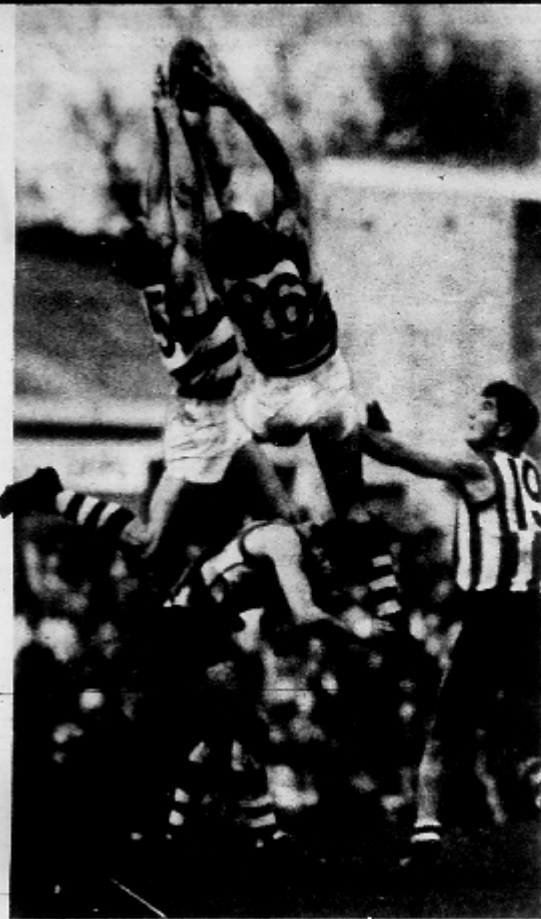
■ Ryan, No. 26

He stands 1.9 metres (6ft 2in) tall and weighs 102 kilograms (116 stone).